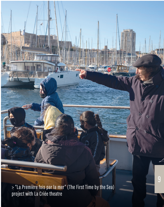
> "La Première fois par la mer" (The First Time by the Sea) project with La Criée theatre