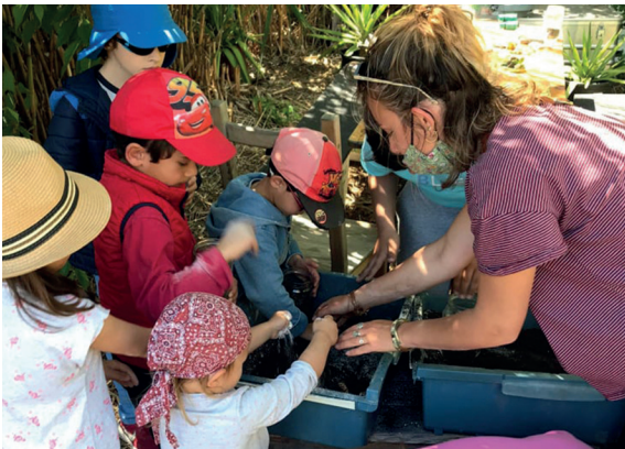
> Educational workshop Le Talus