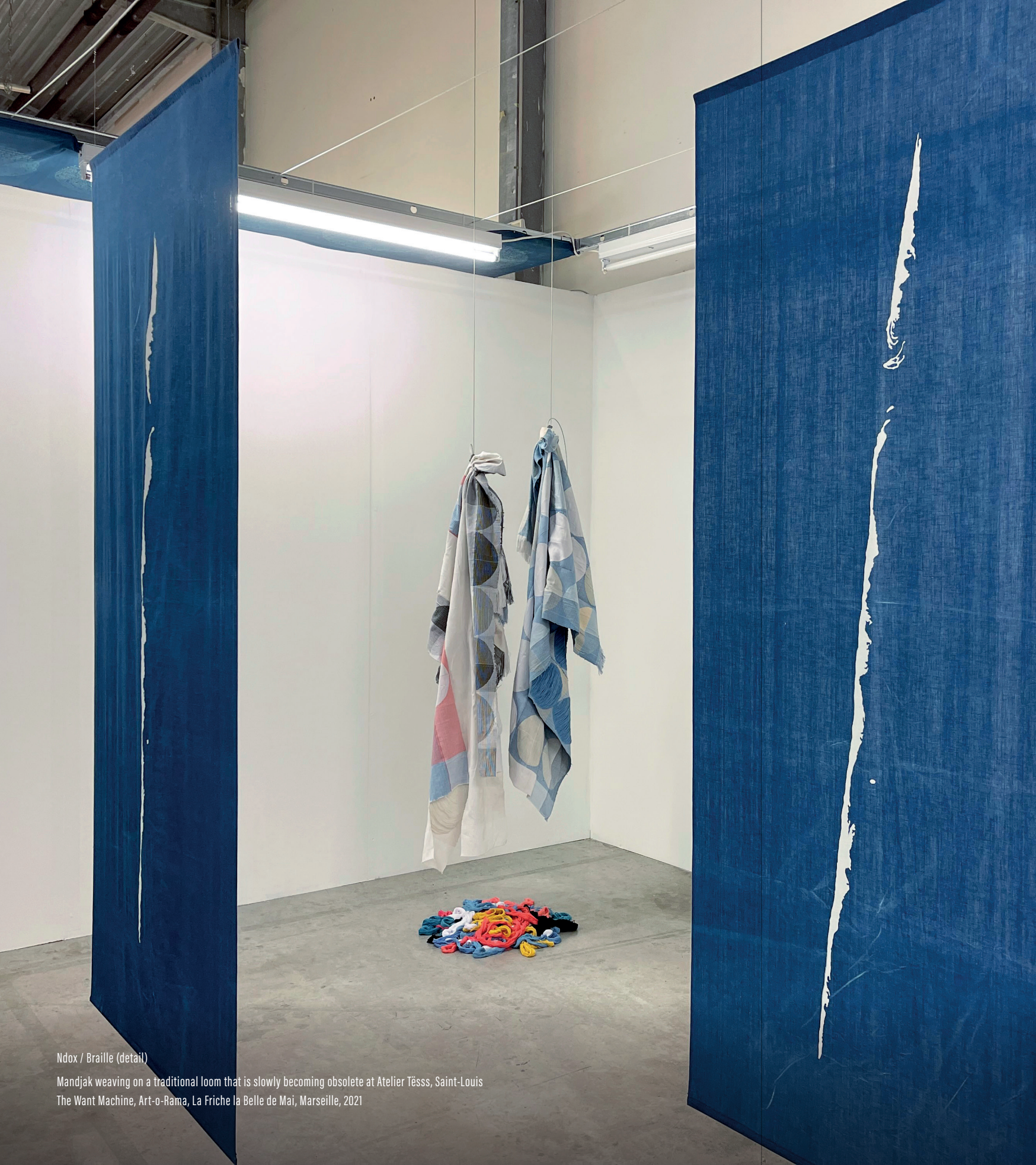
Ndox / Braille (detail)

Mandjak weaving on a traditional loom that is slowly becoming obsolete at Atelier Tëss, Saint-Louis The Want Machine, Art-o-Rama, La Friche la Belle de Mai, Marseille, 2021